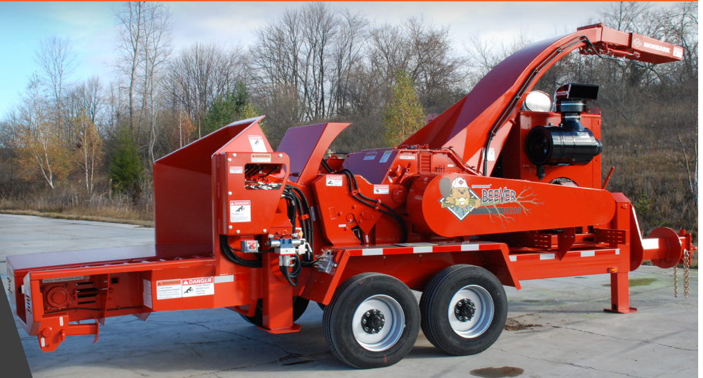
A 6' (1.83 m) infeed bed with live WDH-110 chain drive