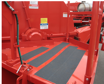
Large work platform makes for easier and safer disc inspections and maintenance.