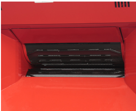
Powerful multi-wheel feed system provides positive feed of logs and tops for excellent chip quality.

Specifications may vary with equipment options