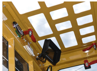
Rooftop escape hatch and full color, dedicated backup camera display