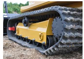
20" (500mm) wide rubber track