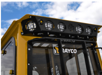
Protected LED Lights (9700 total lumens)