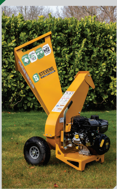
Chips branches up to 70mm