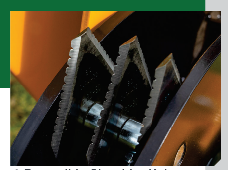
6 Reversible Shredder Knives